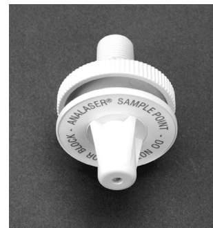
Figure 4. Sampling Point

The AnaLASER II product line offers an array of air sampling network accessories such as a sampling point, capillary tube rolls, sampling point, port and pipe labels.