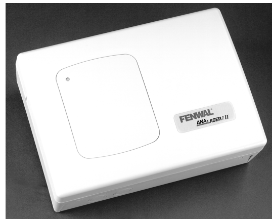
Figure 2. AnaLASER II Detector