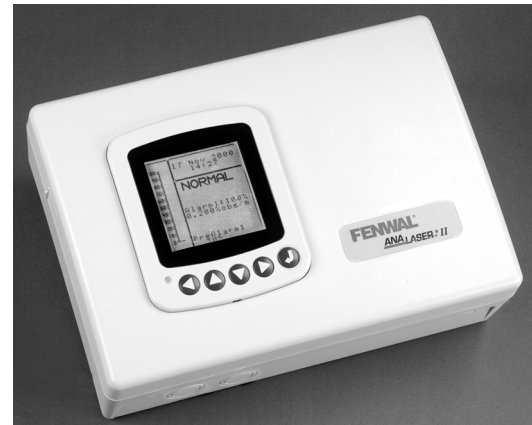
Figure 1. AnaLASER II Detector with Optional Display Module

AnaLASER® is a registered trademark of Kidde-Fenwal, Inc. LaserNET™ and FenwalNET™ are trademarks of Kidde-Fenwal, Inc.