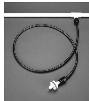
Figure 5. Sampling Point with Capillary Tube